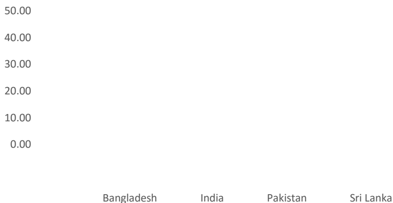
Figure 1: Shadow Economy Size Over Time